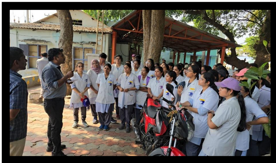
WATER PURIFICATION PLANT